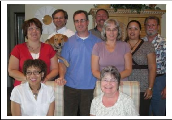
First Pastoral Council 2007