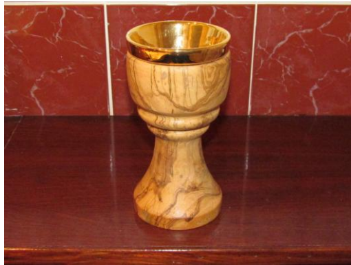
ST. MAXIMILIAN KOLBE VOCATION CUP

The purpose of the Vocation Cup, a consecrated chalice, is to focus on and provide an awareness of prayer in the home for an increase in vocations to the priesthood, the permanent diaconate, the religious life, and lay ministry.