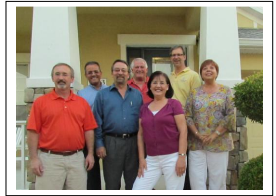
Pastoral Council 2011